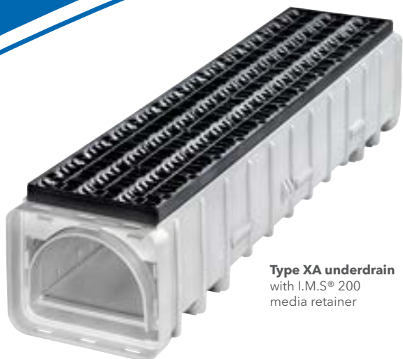
Type XA underdrain with I.M.S® 200 media retainer

FILTRATION INNOVATION, TRUSTED PERFORMANCE